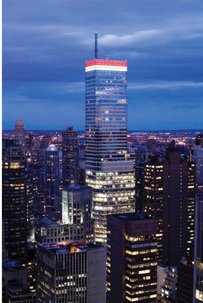
731 Lexington Avenue