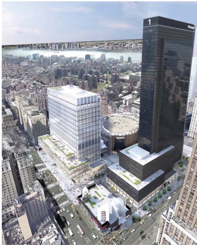
THE PENN DISTRICT - PENN 1 / PENN 2