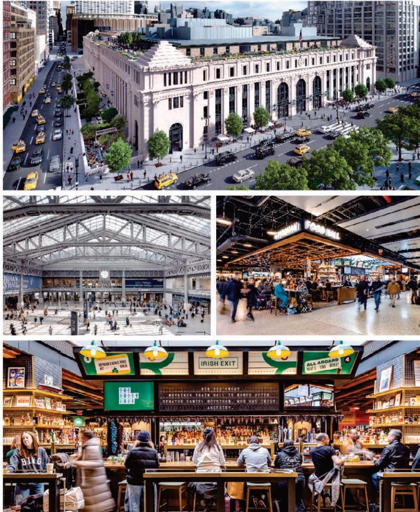
FARLEY - Moynihan Train and Food Halls