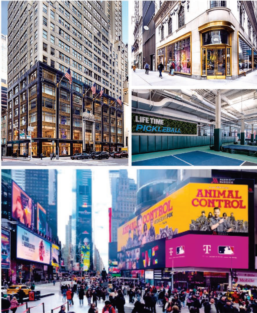
Clockwise from top left: 595 Madison Avenue, 689 Fifth Avenue, PENN 1, 1540 and 1535 Broadway