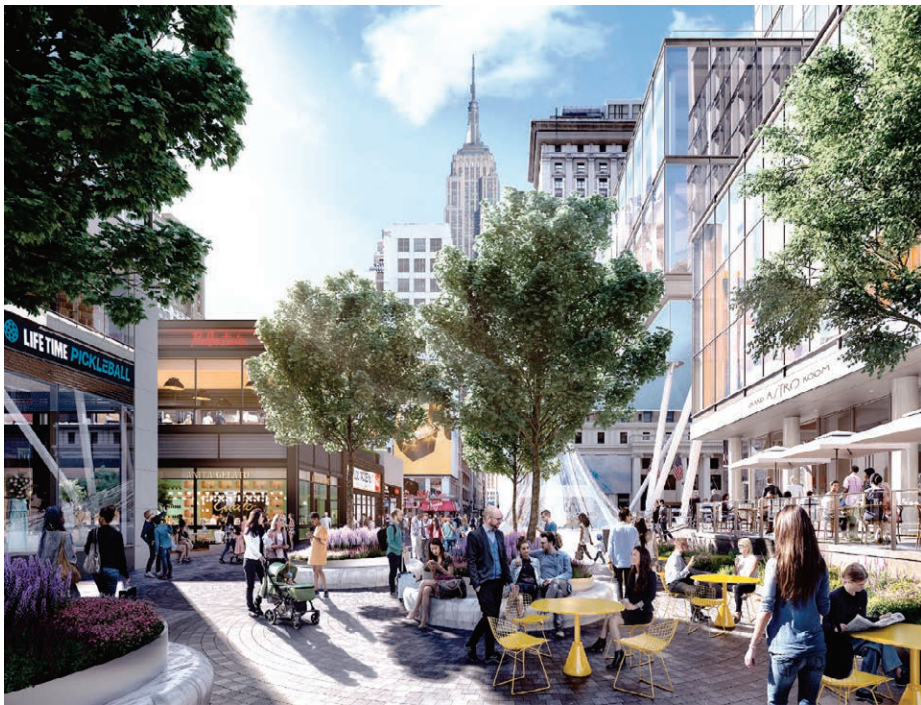
THE PENN DISTRICT