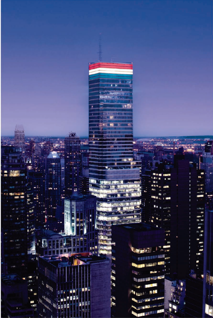
731 Lexington Avenue